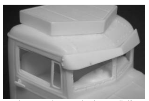
The sunvisor may be attached as well, if you so desire.