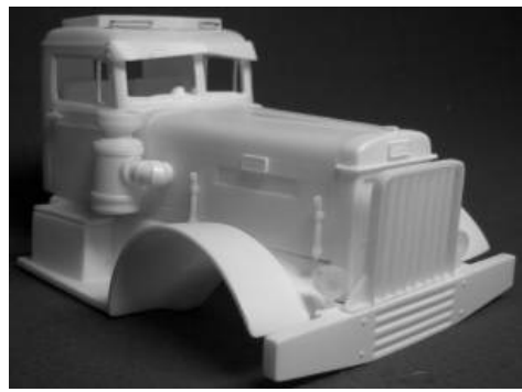
The grille guard can simply be glued on to the top of the bumper, once mounted to your model.