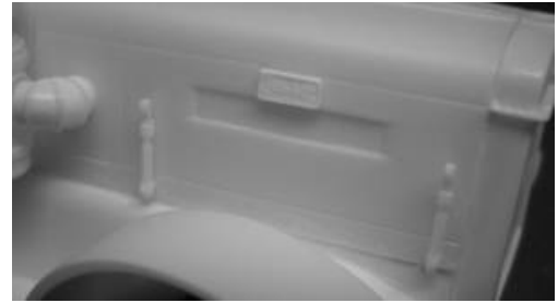
2 hood latches are needed for each side of the hood. Cement with the round portion at the top. Emblems are placed at the top of the butterfly hood side, roughly 2 scale inches (1/25-scale, or centered) from the radiator.